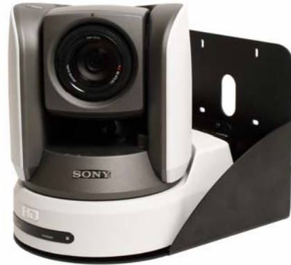
Figure 1: (top) Quick-Connect CCU 1 RU rack mount interface; (bottom) WallVIEW Universal PRO Z700 System with Camera, EZIM and Wall Mount

Overall, the WallVIEW CCU Z700 is superb for a wide range of high definition shooting applications. It is also highly suitable for applications where adjusting the color and brightness levels of one or multiple cameras is critical, such as houses of worship, corporate boardrooms, live event production and distance-learning applications.