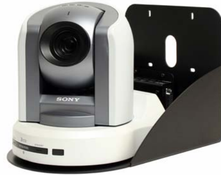
Figure 1: (top) Quick-Connect CCU 1 RU rack mount interface; (bottom) WallVIEW CCU 300 System with Camera, EZIM and Wall Mount

The Vaddio WallVIEW CCU 300 is built around the Sony® BRC-300 standard definition pan/tilt/zoom camera. With three 1/4.7 CCDs, the BRC-300 is an ideal choice for a wide range of video applications. WallVIEW CCU 300 allows the user to adjust color, gain and iris functions on the camera (see Figure 1). These controls allow the camera to deliver a more accurate representation of the image that is being captured. The other added advantages include the ability to color match multiple cameras and make necessary changes to iris and gain quickly and easily. Settings may be stored by using two Scene buttons for various lighting conditions. The WallVIEW CCU uses high speed differential signaling (HSDS), an active video transmission system, to deliver high quality video over standard Cat. 5 cabling. Adjustments allow the video to be extended up to 500 feet from the Quick-Connect CCU with virtually no loss in video quality.