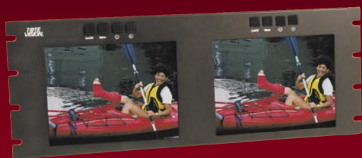
LCD-840D Rack Mount Unit

LCD-840D LCD-840V LCD-840VL LCD-641V LCD-641VL