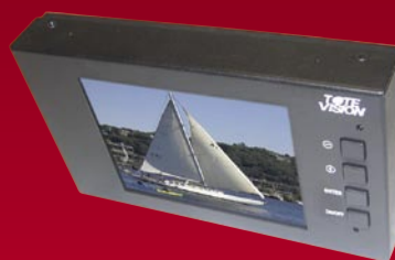
LCD-641V In Metal Case (Bulk Special Order Only)