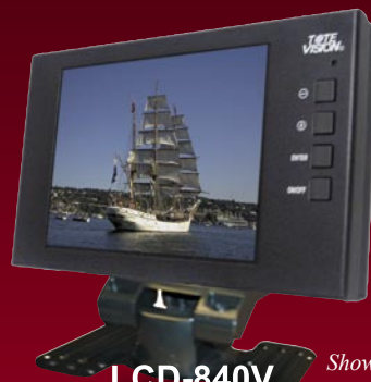
LCD-840V In Metal Case