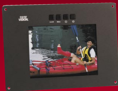
LCD-840VL Flush Mount Unit