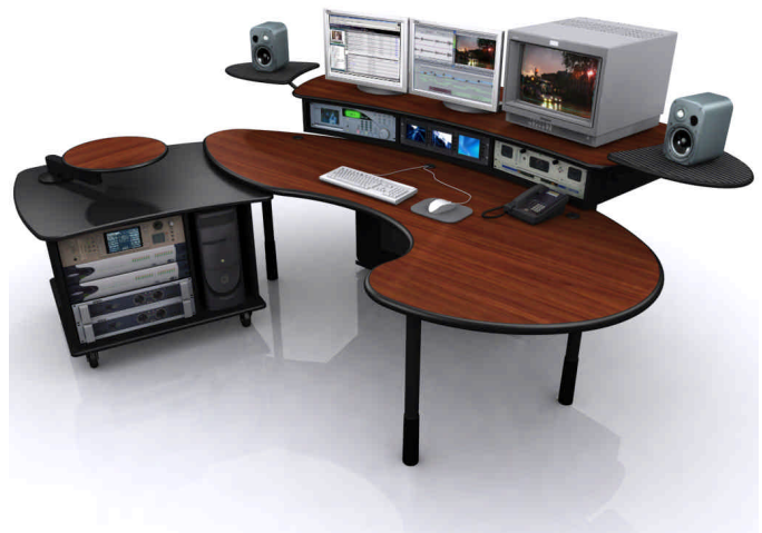
(shown with optional speaker modules, left side equipment cart, and solid mahogany desktop)