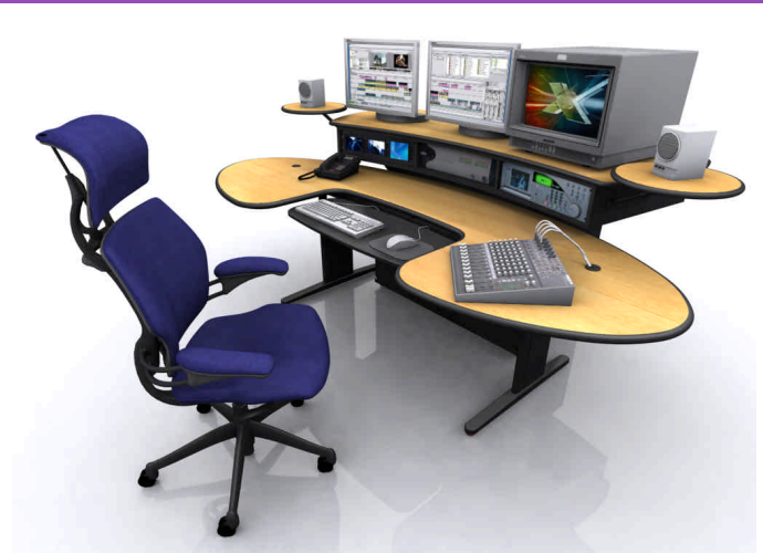
(shown with optional speaker modules and articulating keyboard platform)