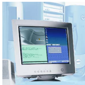
Real-time quad view

Be more productive, organized and efficient with the dynamic new QuadraVista Quad video KVM Switch from Rose Electronics.