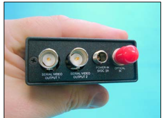
Small, Compact with Re-clocked, Loop-Through Input and Dual Re-clocked Outputs