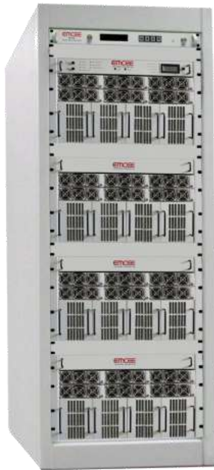
Shown with DRP-1000

All PA modules are identical and inter-changeable. Each PA module features a high-speed logic switch which disables the module if a fault occurs or if the module is removed from the transmitter. Modules are protected against high VSWR, over-temperature, loss of bias, and RF overdrive conditions. And, a failed power amp does not cause an outage!