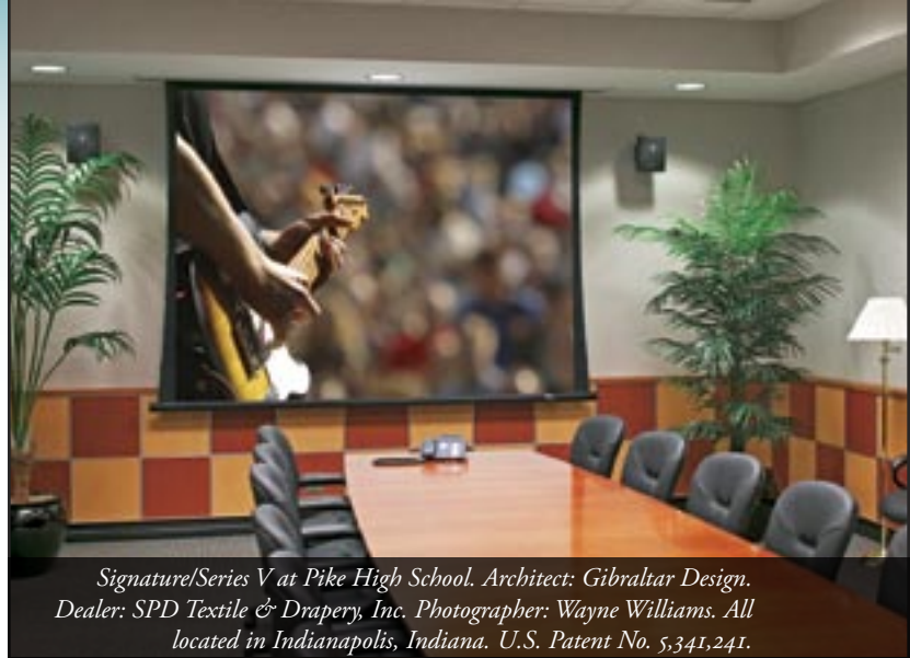
Signature/Series V at Pike High School. Architect: Gibraltar Design. Dealer: SPD Textile & Drapery, Inc. All located in Indianapolis, Indiana. U.S. Patent No. 5,341,241.

This screen is available with optional Quiet Motors. See page 4 for more details.