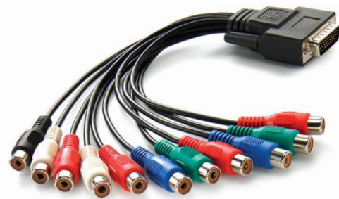
Breakout Cable (Analog video and audio connections)