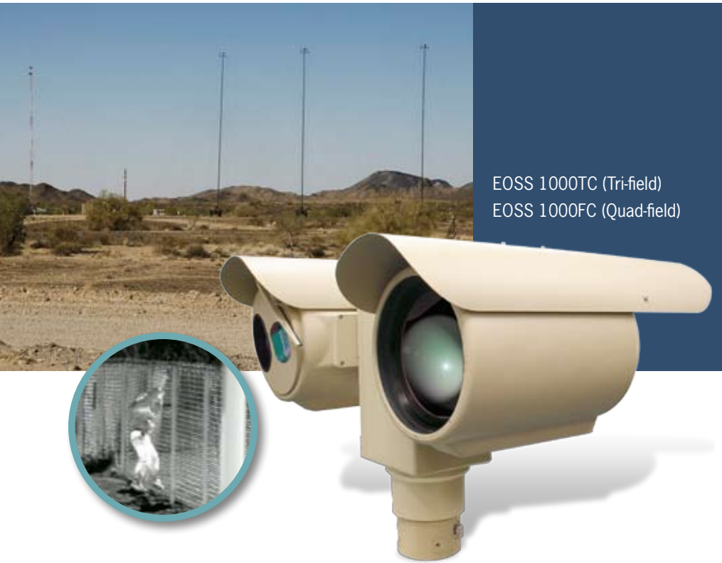
EOSS 1000TC (Tri-field) EOSS 1000FC (Quad-field)

The Axsys EOSS 1000 EO/IR is an extreme long-range infrared camera system capable of resolving man-sized targets at over 20 kilometers.