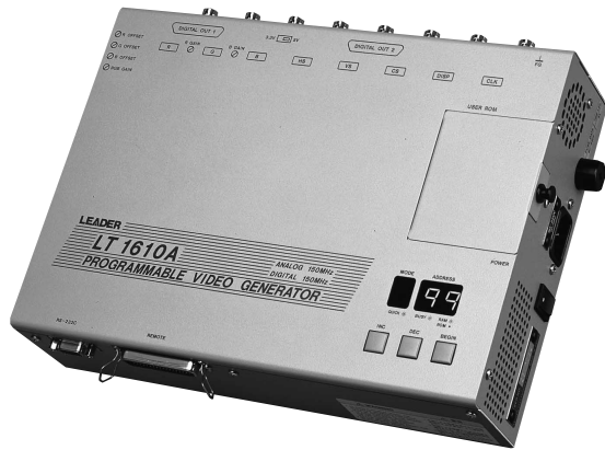
LT 1610A, LT 1611, LT 1612A (LT 1610A shown)

This group of three RGB generators offers dedicated analog, digital or combined analog/digital outputs to best suit application needs. Dot clock frequencies handle a wide range of applications ranging to SXGA (1200 x 1024). All in the group operate from user-replaceable ROMs making them ideal for production operations wherein parameters are not to be altered by operators. Remote control units (LT 1610-01) extend program selection to remote control points and widen operator control to signal output conditions including sync format and polarities. Full PC control gives the operator complete control over raster architecture, signal-output conditions and selection from stock and custom patterns.